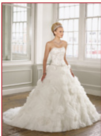
BALL GOWN SILHOUETTE

4 Determine what features you want on your gown. These features include the type of neckline, waistline, train, beadwork or lace on the bodice and skirt, and other decorations or embellishments. Once you have determined which silhouette, color and fabric you like best, decide if the gown should have sleeves, straps or if you prefer one that is strapless. You will want to try