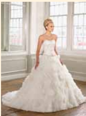
BALL GOWN SILHOUETTE

4 Determine what features you want on your gown. These features include the type of neckline, waistline, train, beadwork or lace on the bodice and skirt, and other decorations or embellishments. Once you have determined which silhouette, color and fabric you like best, determine if the gown will have sleeves, straps or if you prefer strapless. You will want to try on a variety of gowns to help you find what you like best as you bring "the perfect gown" into closer focus.